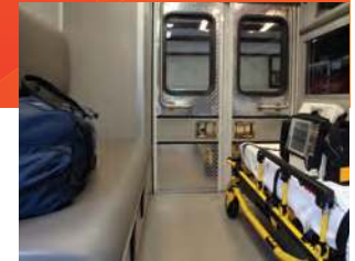
Attach cushioning panels in an ambulance or bus.