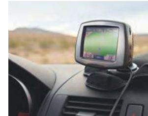
Anchor vehicle accessories to dashboard.