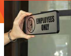
Secure plastic signs to window glass.

3M, Dual Lock and VHB are trademarks of 3M Company. Used under license in Canada. Please recycle. Printed in USA. © 3M 2017. All rights reserved. 70-0709-4083-1 (Rev 3/2017)