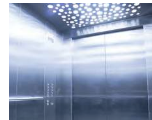
Attach elevator control panel to interior wall.