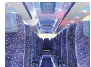
Fasten ceiling panels to interior for future access.