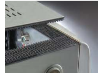
Attach access panels to industrial, electronic and electrical equipment.